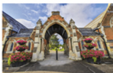
Dunstable Cemetery

Tickets cost £5.00 and need to be booked in advance from Priory House Heritage Centre on 01582 891420