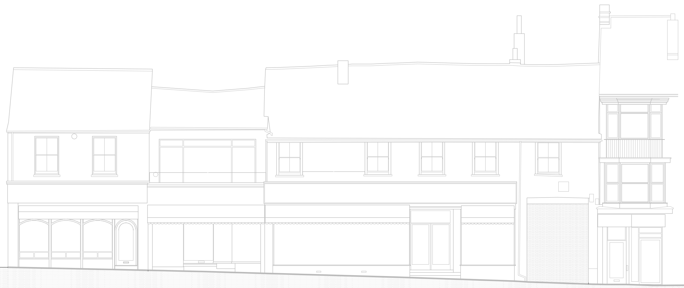
No.21 High Street South EXISTING ELEVATION

Conception Architects Studio Gothic House Barker Gate Nottingham NG1 1JU