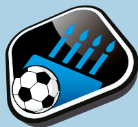
CREASEY KICKZ FOOTBALL PARTIES